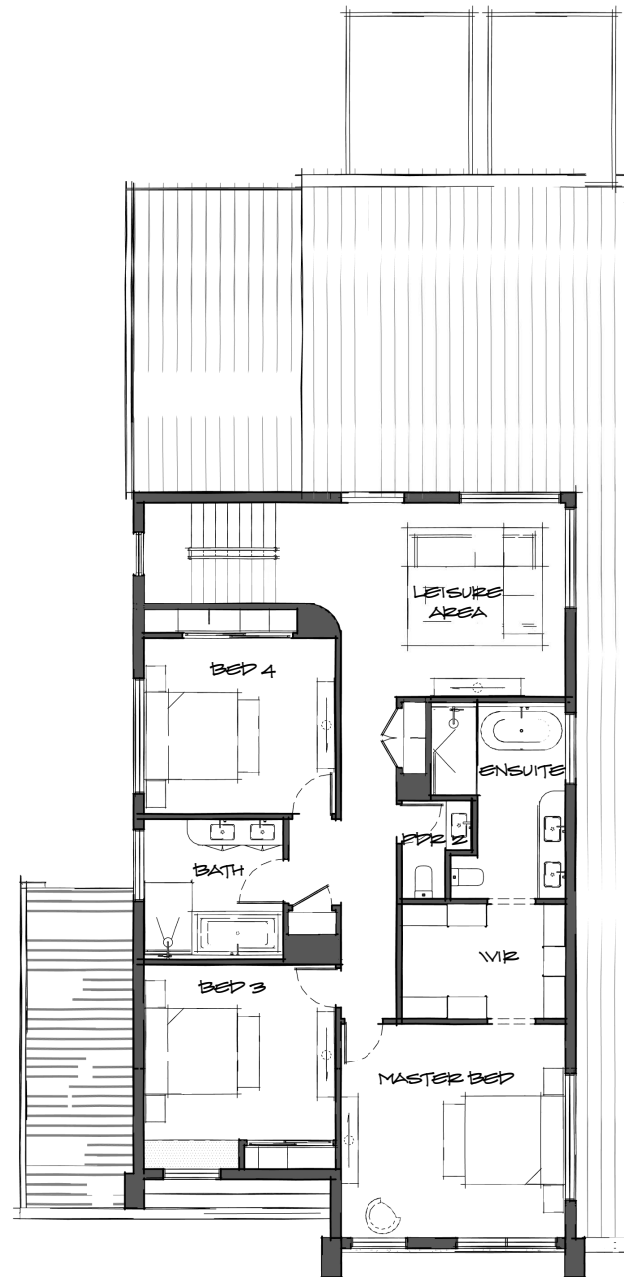
First Floor Marketing Plan